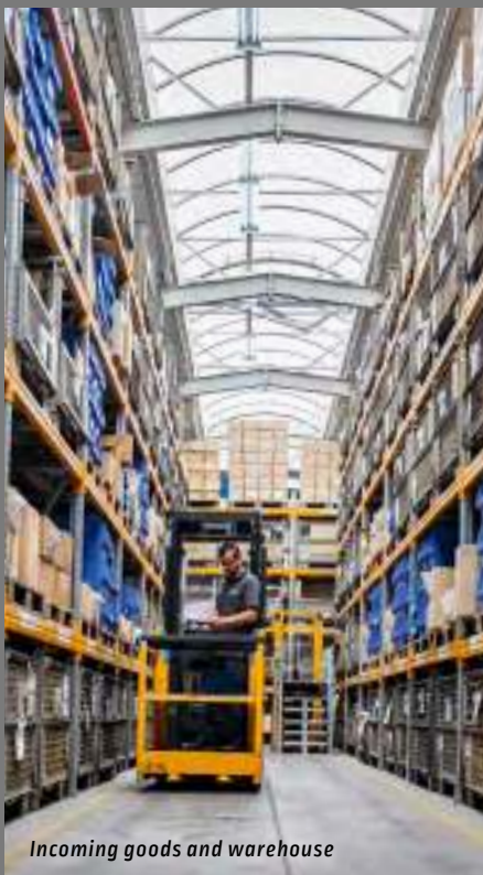
Incoming goods and warehouse