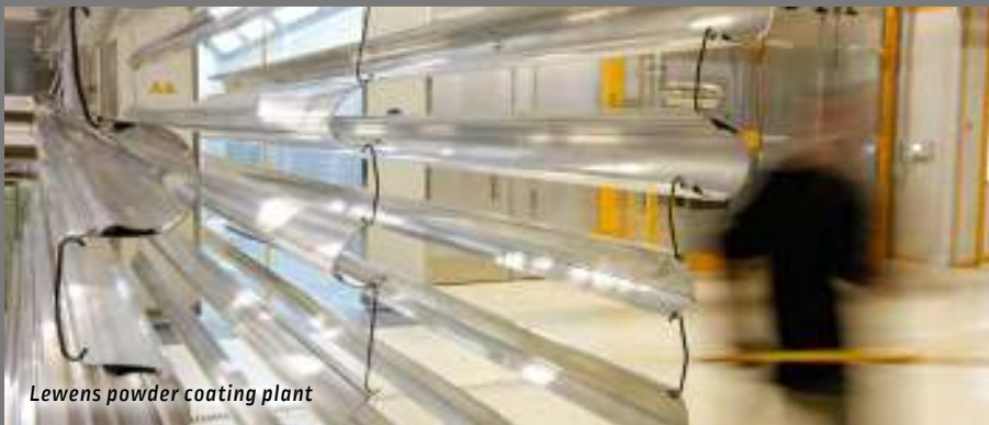
Lewens powder coating plant