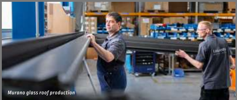
Murano glass roof production