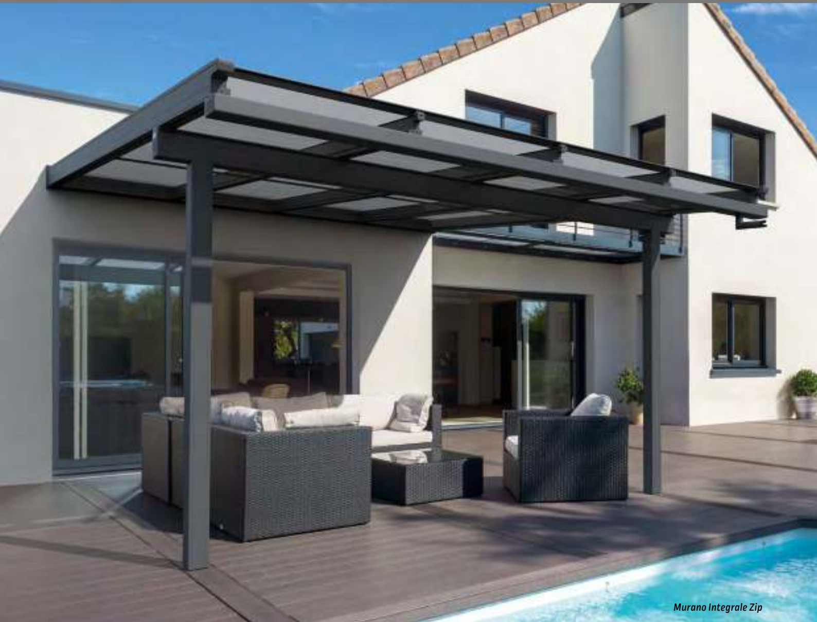
Murano Integrale Zip

„ The market has changed, and Lewens always moves with the times. “