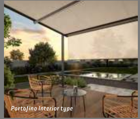
Portofino Interior type