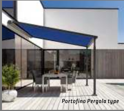
Portofino Pergola type