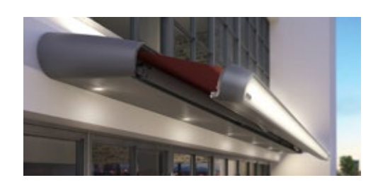
LED Spots in the cassette / canopy

This brilliant lighting effect converts the room under the awning into an oasis of well-being in the evening.