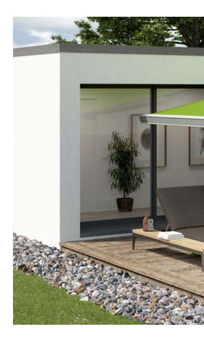
LED Spots in the underside of the cassette

The MX-1 compact provides beautiful protection