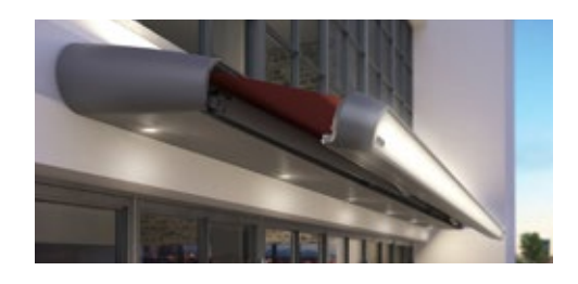
LED Spots in the cassette / canopy

This brilliant lighting effect converts the room under the awning into an oasis of well-being in the evening.