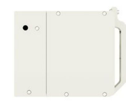
Angular design Precise recess installation will make the markilux 3300 blend perfectly into its structural surroundings.