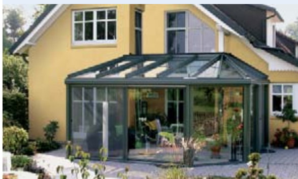
▲ weinor conservatories

No matter what you want to use your patio for, weinor has the right product for you – awning, patio roof, Glasoase® and conservatory