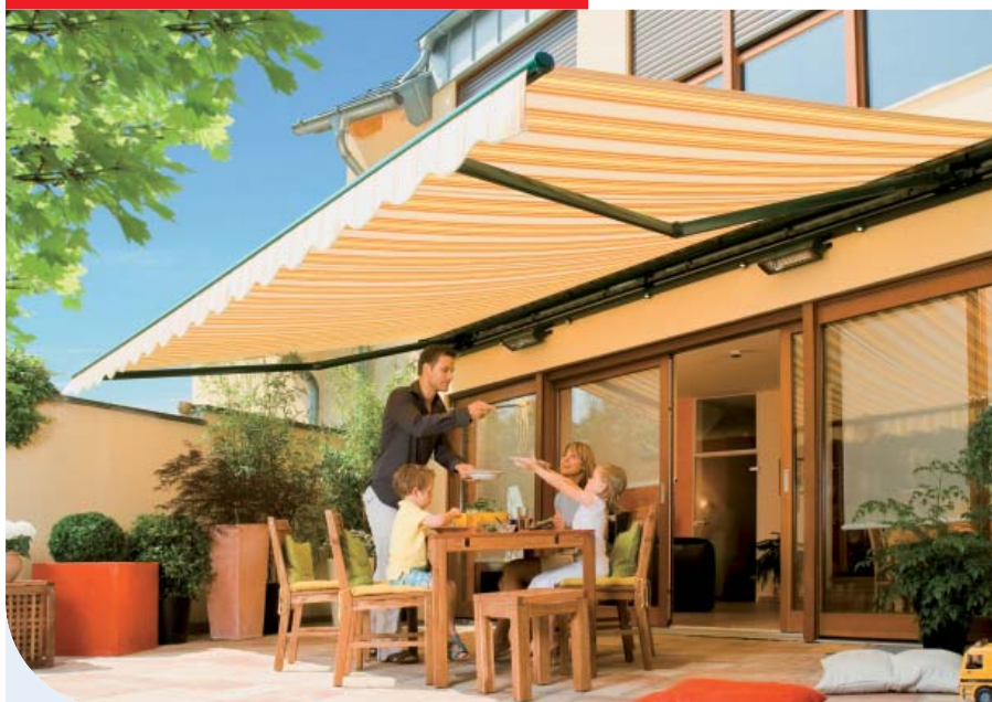
▲ weinor awnings