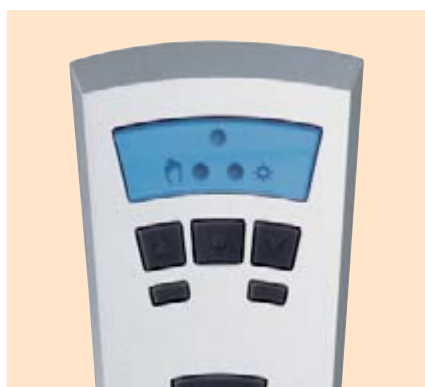
WeiTronic Remoto 1M

We reserve the right to make technical alterations. March 2010