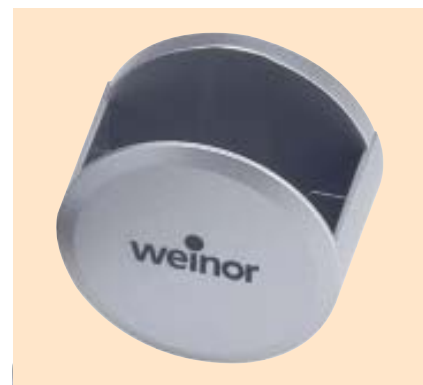
Remoto wall holder

It controls 5 receivers (e.g. 5 awnings) or 5 groups of receivers (e.g. 5 groups of awnings) individually or at the same time.