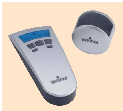
WeiTronic Remoto 1 with wall holder