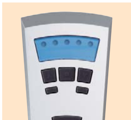
WeiTronic Remoto 5

It controls 1 receiver (e.g. an awning with WeiTronic Combo-868 MA ) or a group of receivers (e.g. dimming function for lighting or heating).