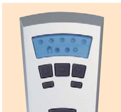
WeiTronic Remoto 5M

It controls 1 receiver (e.g. an awning with WeiTronic Combo-868 MA ) or a group of receivers (e.g. dimming function for lighting or heating), and, in addition, it activates or deactivates the sun sensor WeiTronic Lumero-868 , the sun and wind sensor WeiTronic Aero-868 AC 230/Solar or sun wind and rain sensor WeiTronic Sensero-868 AC 230 Plus .