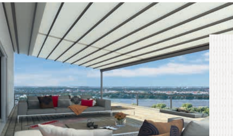
Frame colour WT 029/70786 | Pattern Pergona classic PE 10