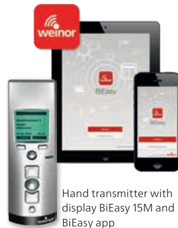
Hand transmitter with display BiEasy 15M and BiEasy app

With the infrared Tempura heating you can use your patio for longer into the evening – also during the colder times of year. It brings pleasant, instant heat with no warm-up time. The Tempura is dimmable, energy efficient and easy to operate.