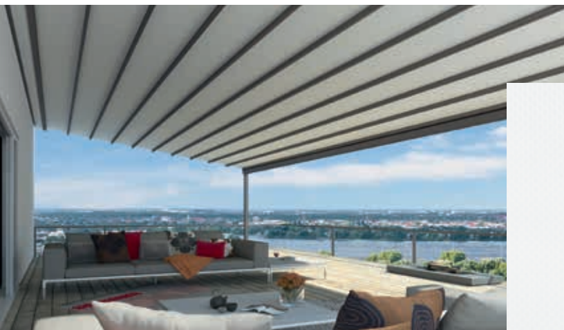
Frame colour WT 029/70786 | Pattern Pergona classic NA 78410

9 trend colours 47 standard RAL colours Adjust the PergoTex II perfectly to your patio.